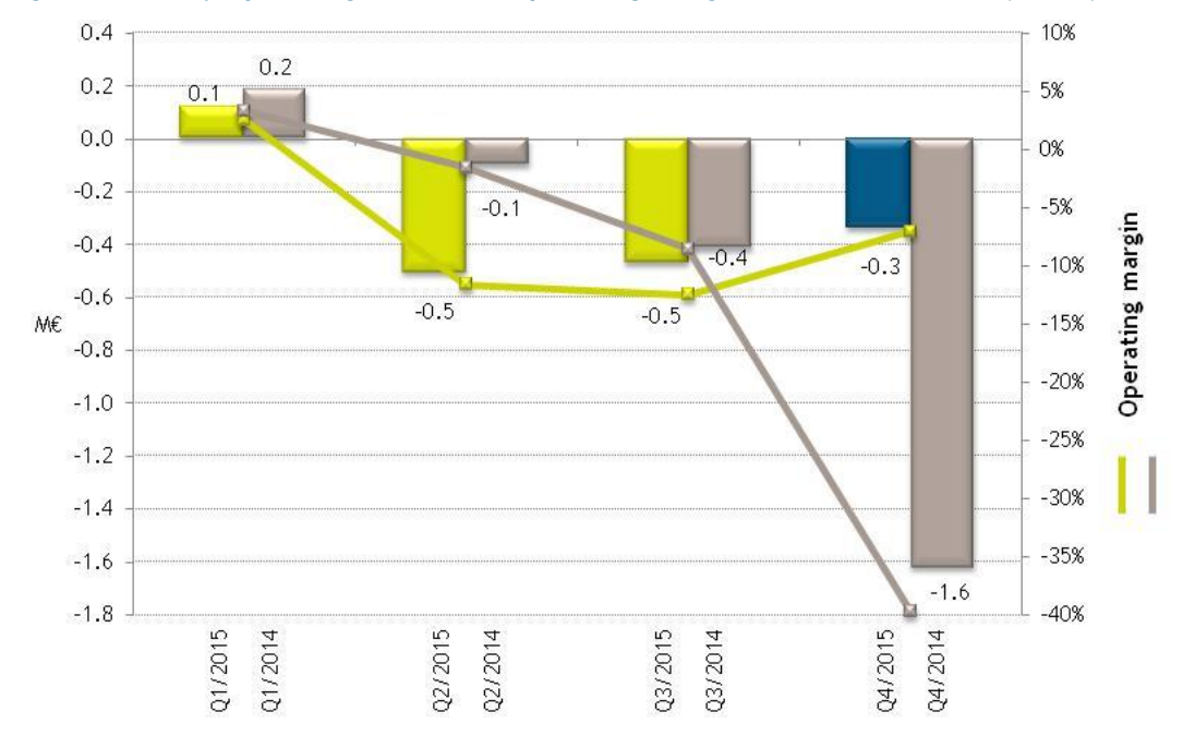
Fig. 3 Quarterly operating result and operating margin in 2015 and 2014 (M€, %)